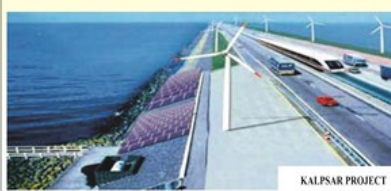
KALPSAR PROJECT - CREATING WORLD BIGGEST A FRESH WATER RESEARCH