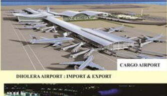
DHOLERA AIRPORT - IMPORT & EXPORT