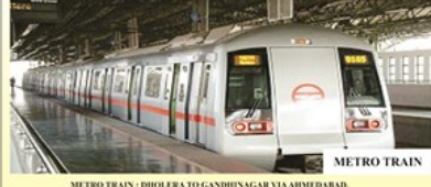
METRO TRAIN - DHOLERA TO GANDHINAGAR VIA AHMEDABAD.